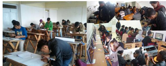
Engineering Drawing Industrial Training

The successful candidates of the Diploma course will be awarded by the State Council for Technical Education Nagaland. These Diplomas are recognised by the All India Council for Technical Education, New Delhi. Ministry of Human Resources, Government of India.