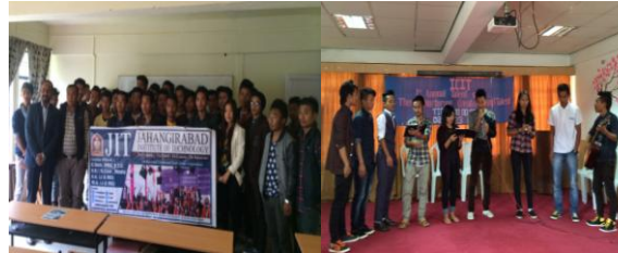
Industry Interaction Talent Exposure

We are committed to "Redefining Education" in making our students "Employable and self sustainable" .