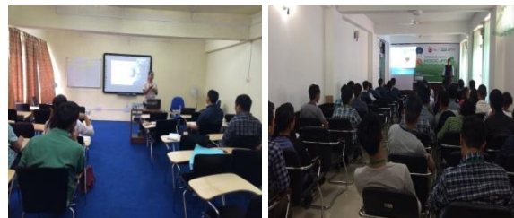
Training in Tutorial room Android app workshop