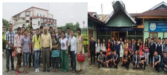
Tour to IIT Guwahati EU Outreach