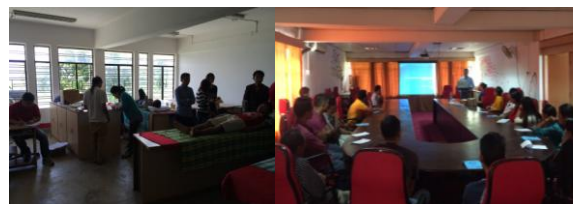
Blood donation Conference hall