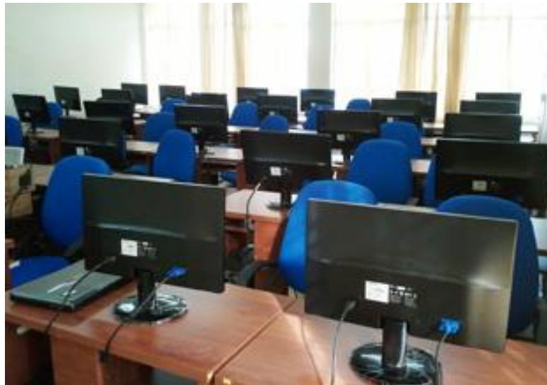
Pic 2 : Computer Lab