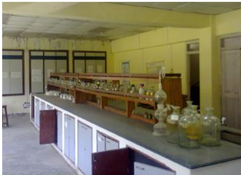
Pic 3 : Chemistry Lab