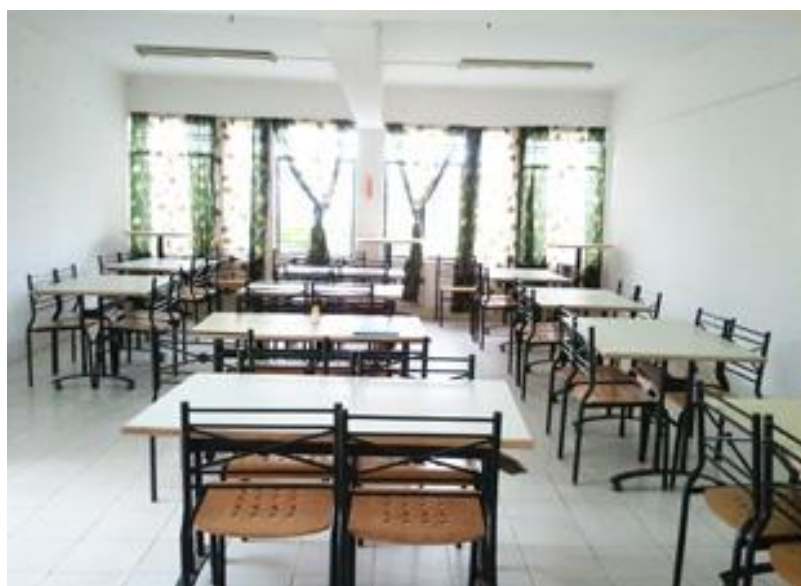
Pic 4 : Canteen