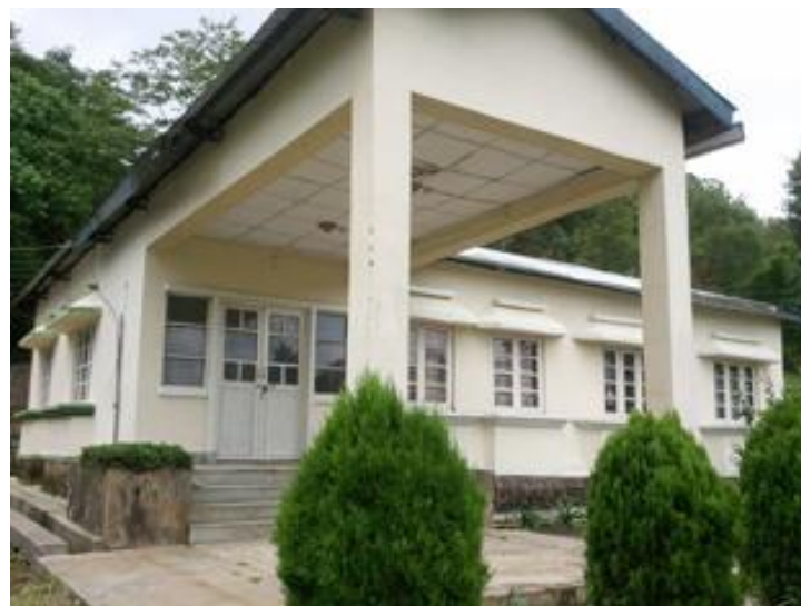
Pic 7 : Principal's Quarter