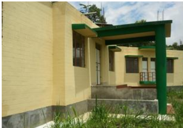
Pic 6: Guest House