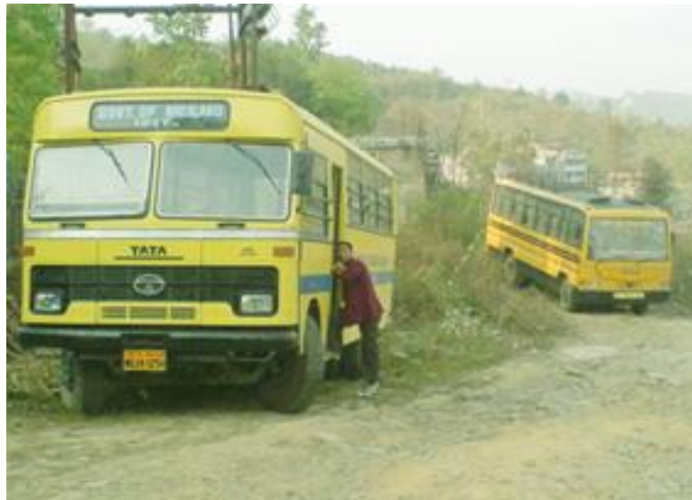
Pic 5 : Institute Bus